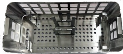
Stainless Steel Custom Insert with Graphics

Meditray Stainless Steel Baskets and Case Trays correspond to Case Medical's full line of SteriTite containers